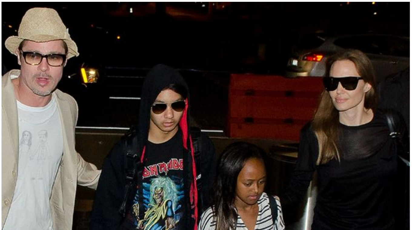
Brad and Ange have agreed on custody of their children.

Brad Pitt and Angelina Jolie have one of the most complicated divorcing family situations around, so if it works for them, it can work for anyone.