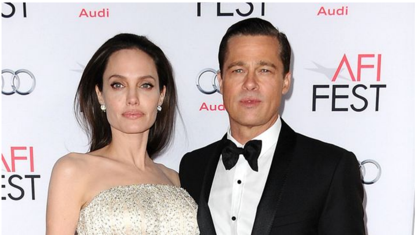
Brad Pitt and Angelina Jolie separated after 12 years together.

It sounds like heaven, and while it can be a little fiddly to set it up initially, once all the particulars of your situation have been entered, it makes life a lot easier.